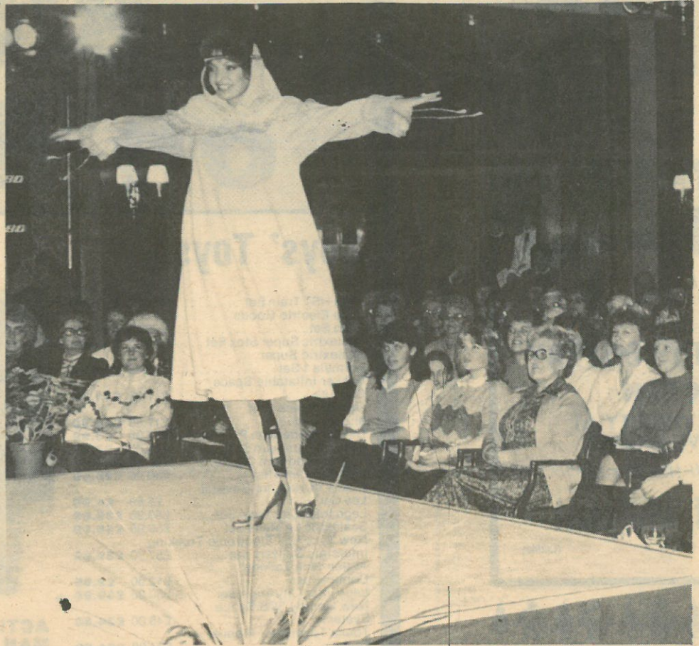
One of the models "giving a twirl" at the STV / Round Table fashion show.

Forty-three of the winning designs which were demonstrated, nay, choreographed by the professional models were produced by The Vilene Organisation. Other sections featured the products of Lyle & Scott, Barrie Knitwear and Pringle — all of Hawick.